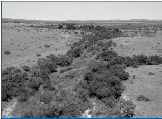
Riparian area buffer zones reduce the amount of sediment that enters streams. They also benefit wildlife by providing food, cover, travel corridors, and nesting sites.

Texas has more than 60 million acres of forests and woodlands (about the size of Louisiana and Mississippi combined) that are both economically and environmentally significant. Land operations designed to enhance grazing, property access, wildlife, aesthetics, wildfire mitigation, or other management activities have the potential to negatively impact soil and water resources if poorly planned or implemented. Best Management Practices (BMPs) are the principal means of protecting soil and water resources during these management activities.